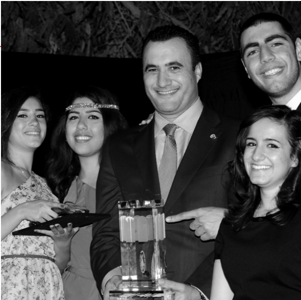
Winning team of 2nd Annual Vis Middle East Pre-Moot Muscat, 2012

in Vienna in 2011 and Muscat in 2012 with participants from 8 countries: