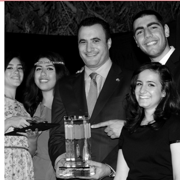
Winning team of 2nd Annual Vis Middle East Pre-Moot, Muscat, 2012